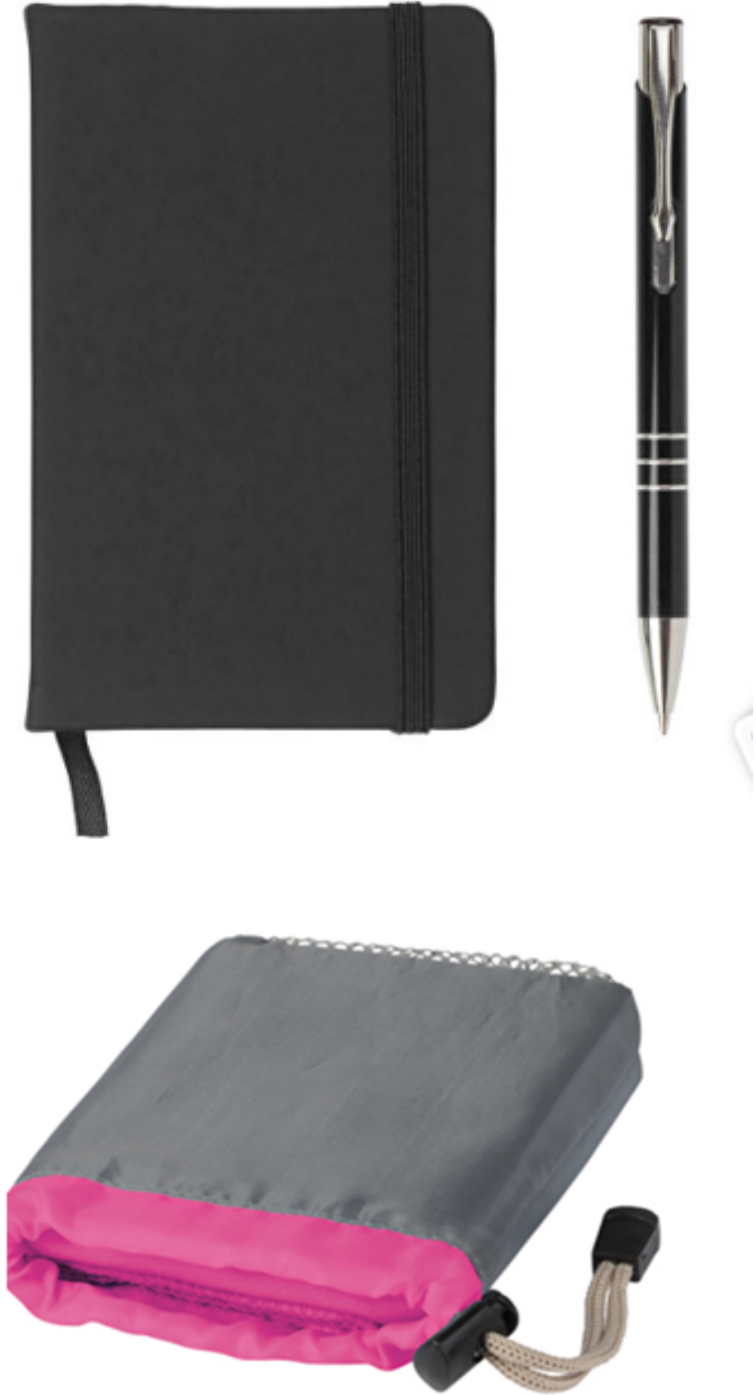
Figure A1: Items used in the experiment